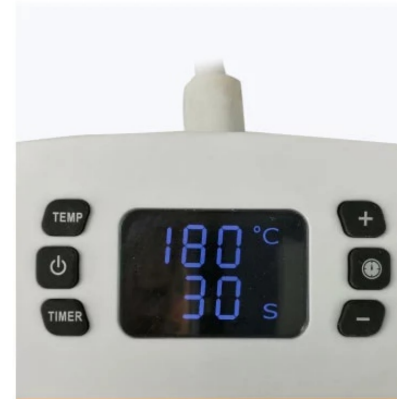
Instrument operation Set temperature and time.