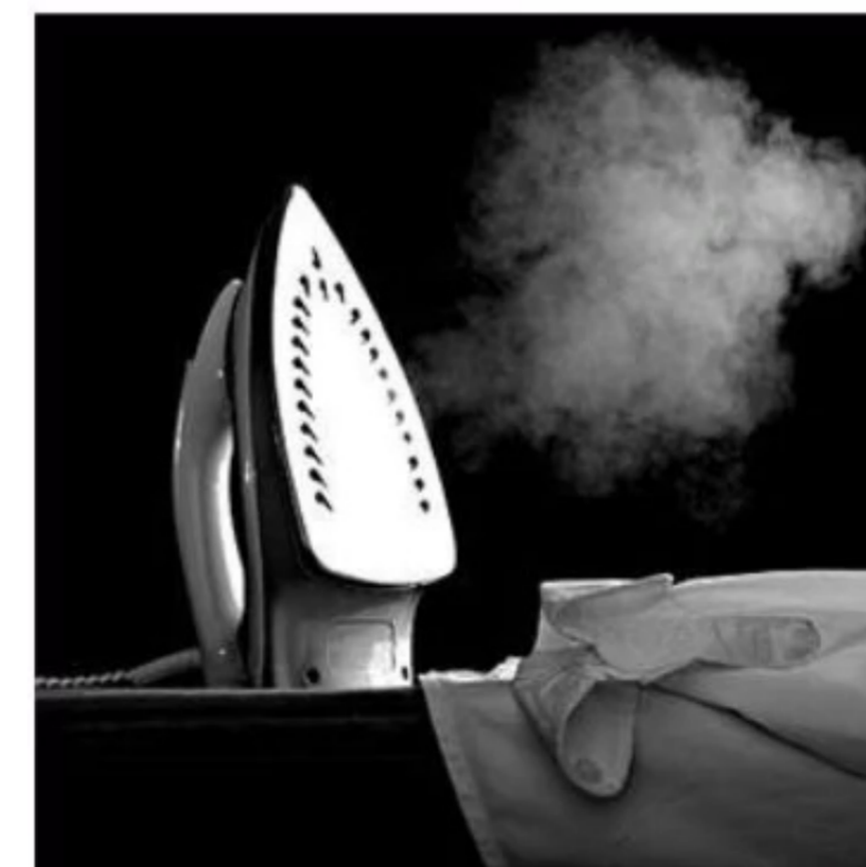
Household iron The heating element in a household iron was designed to produce steam and remove wrinkles and creates one big hotspot in the middle.