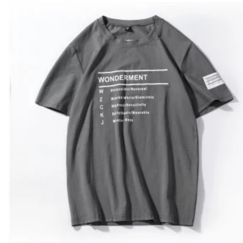
Enjoy professional results that last Even after repeated washes, your designs—no matter how complex or intricate—will really stick.