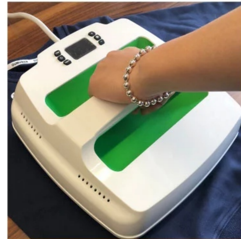
Apply heat and gentle pressure. An evenly heated, ceramic-coated plate adheres iron-on film beautifully in 60 seconds or less.