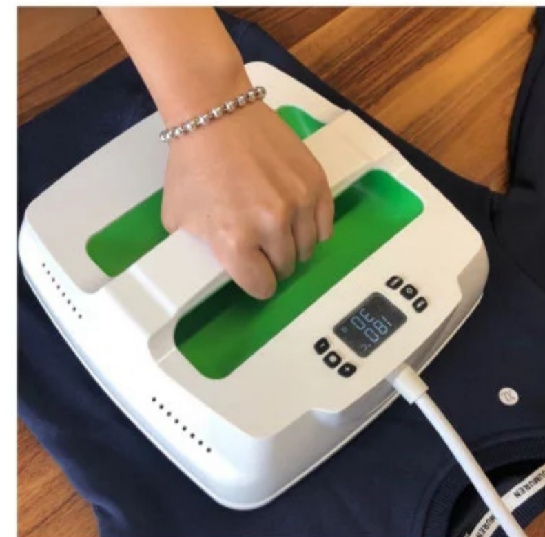
EASY PRESS 9 EASY PRESS 9 features two heating elements that snake through its large ceramic plate. The result is dry, flat, even heat—necessary conditions for flawless iron-on results.